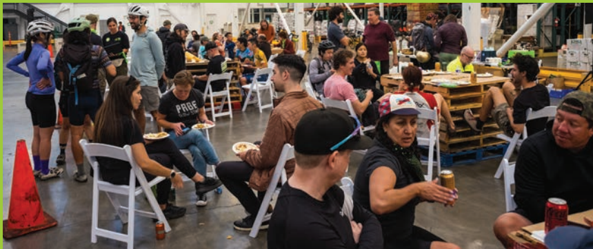
It takes a village to make this party happen.

Missed out? Join us next year! Watch supermarketstreetsweep.com or our Instagram ( @bicycle.law ) for updates.