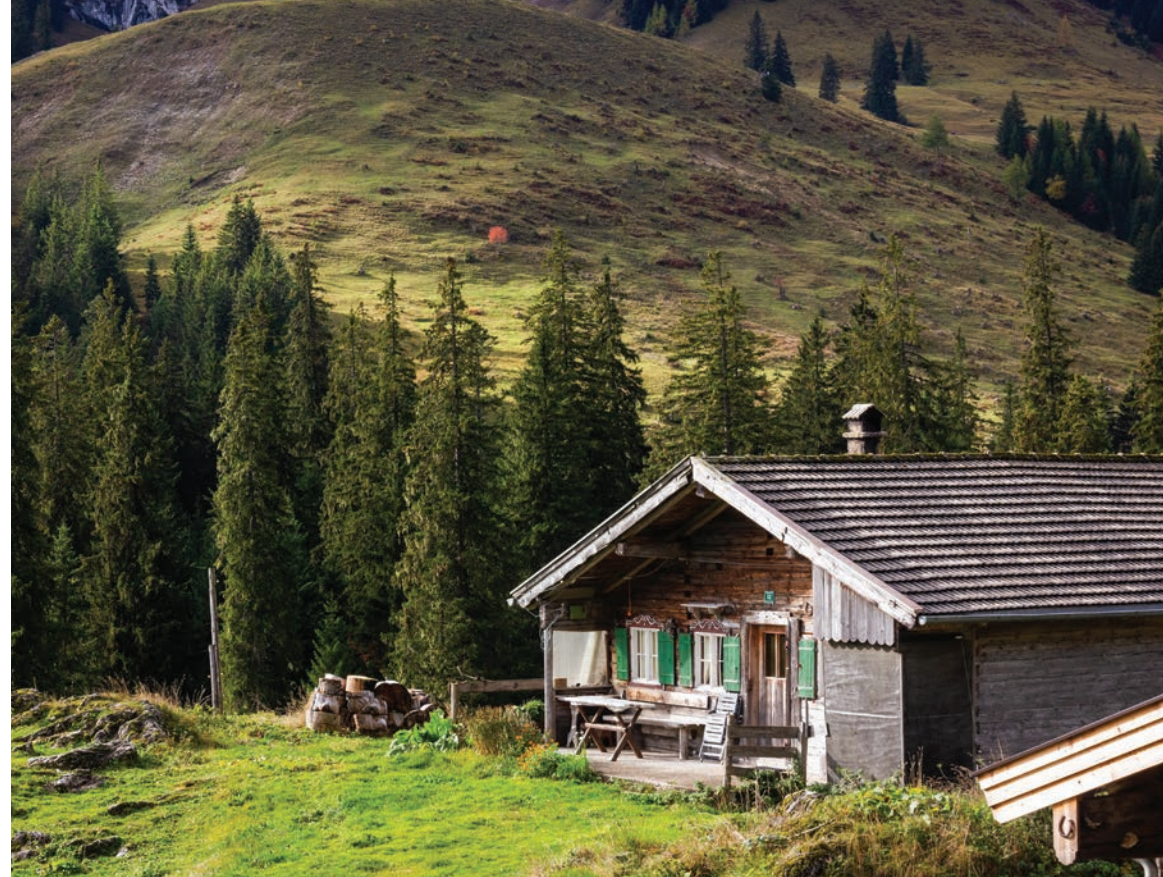
Sometimes fear-setting isn't enough. Time for a vision quest.

In rare circumstances, one can search one's soul and find that the answer is no. That's a problem. Consult with one of the many trial greats who are willing to step into a case to see if someone can take over. Re-evaluate settlement options, if good ones exist. It is wise to do this vision quest well before the trial date to allow for time to pivot. The last thing one should do is head into trial sweating out doubt. If one cannot co-counsel or settle, one has no choice but to build that belief from scratch. Watch 300 and The Verdict , blast walk-on music, and accept the honor. Of the tens of thousands of lawyers, your client chose you. Your knowledge, skill, and talent brought you to where you are now — a trial lawyer. Step into that arena, get bloodied, and win the damn case.