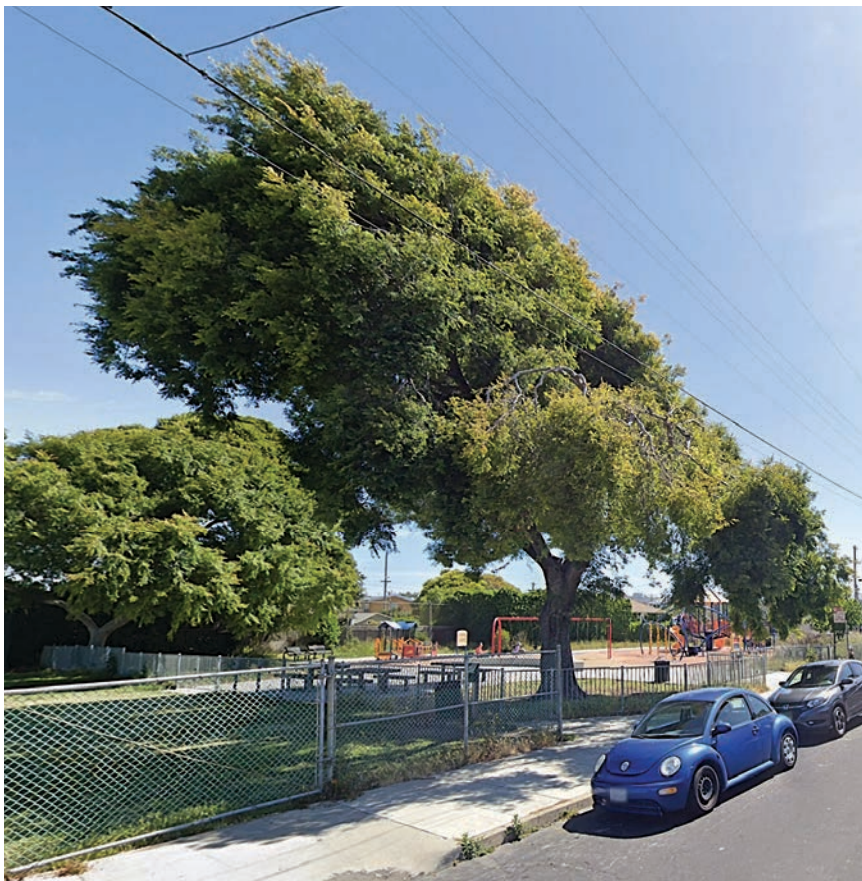
Our investigation revealed that the tree was not native and was prone to breaking.

Coopers LLP recently secured an $890,000 settlement on behalf of a mother and her two young daughters after a dangerous public property condition left the mother with life-altering spinal injuries. Our team's thorough investigation and expert medical causation testimony were able to overcome a powerful defense that focused on the client's medical history and treatment gaps.