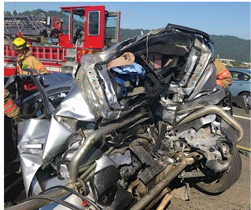
Richard's car, almost unrecognizable after the collision.